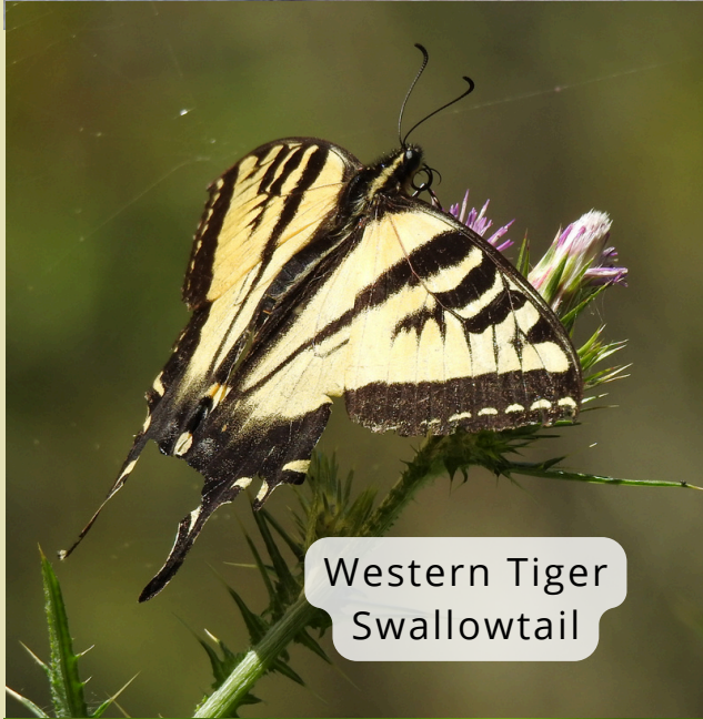
Western Tiger Swallowtail