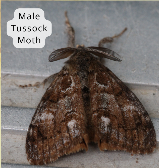
Male Tussock Moth