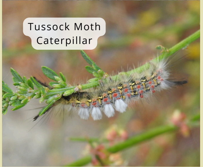
Tussock Moth Caterpillar